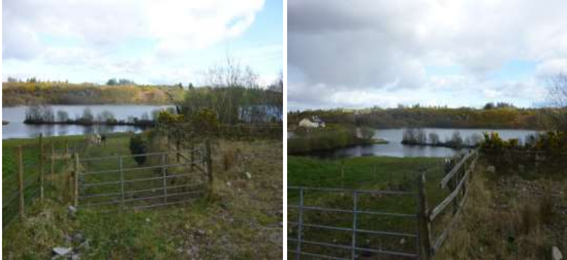
View from site

Situated in an attractive rural countryside setting this site offers marvellous views of Lough Scolban, this site extends to the foreshore. With a beautiful outlook overlooking the beauties of Fermanagh, this site is convenient to Belleek and 11 miles to Kesh, centrally located for trips to the coast of Donegal, Rosnowlght and Bundoran.